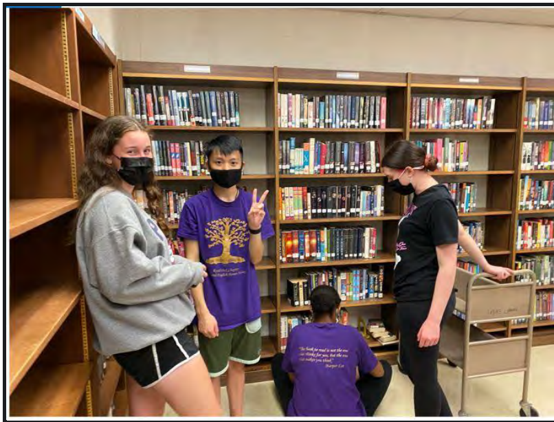
The reshelving begins as one of the volunteers lets us know things are going well!