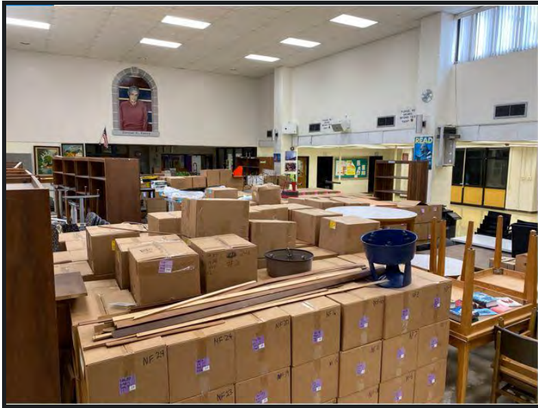
So many boxes, so little time.